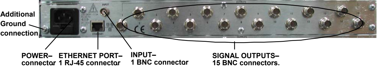
Figure 2: Rear panel